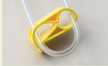
The tube is not blocked by the clamp.