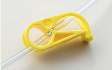
The tube is blocked by the clamp.